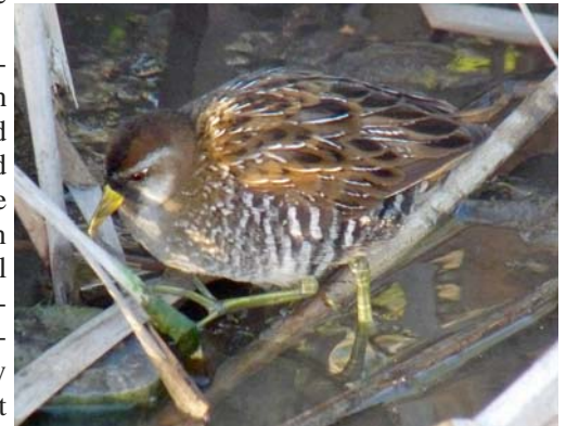
Sora