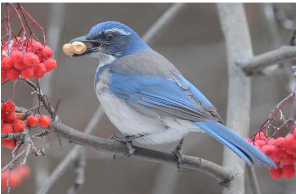
Western Scrub Jay