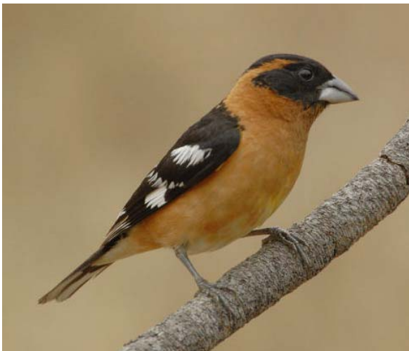
Black-headed Grosbeak

Please e-mail me with your bird sightings at Rich712@aol.com or phone me at 965-1134.