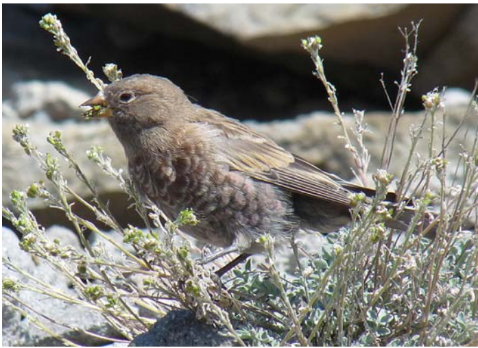
Immature Gray-crowned Rosy-Finch