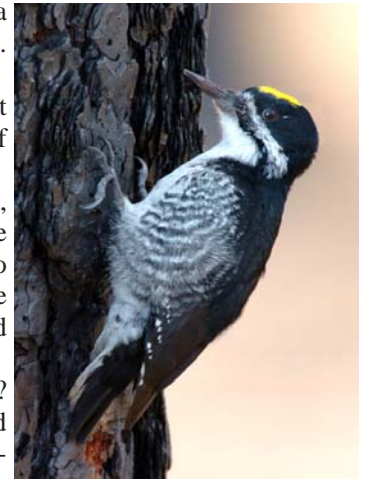
Black-backed Woodpecker