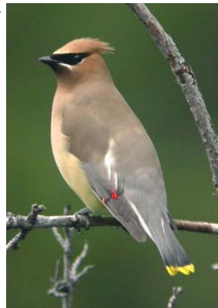
Cedar Waxwing