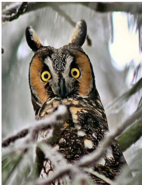
Long-eared Owl