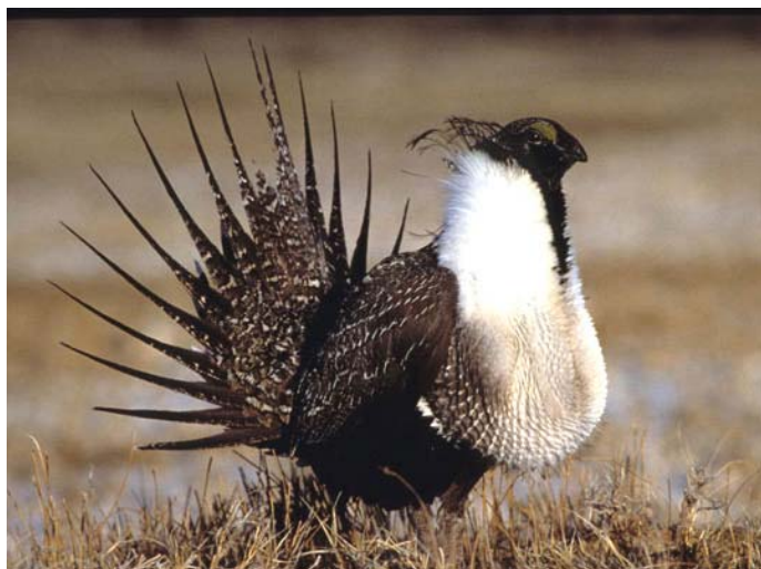
Greater Sage Grouse displaying

I am a member of the Sage Grouse Working Group. This panel is a group composed of biologists from the Washington Department of Fish and Wildlife (WDFW), US Fish and Wildlife Service (USFWS), Yakama Nation, The Nature Conservancy, US Department of Agriculture (USDA), Washington State Parks, and concerned members from the public such as the Audubon Society, and Washington Cattlemen's Association. This group is interested in conservation of the Greater Sage-Grouse. We met in Toppenish on March 1. This meeting updated us all on actions underway aimed at conserving populations and habitat for the grouse, a cornerstone species of the shrub-steppe habitat in the Columbia Basin.