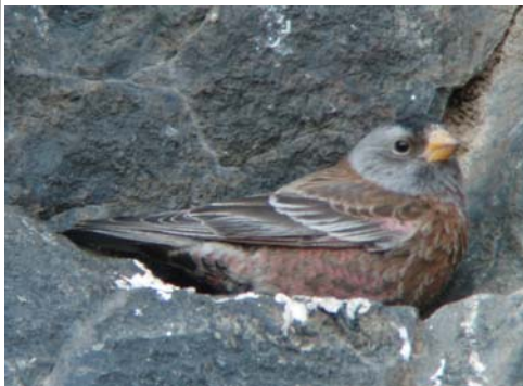
Gray-crowned Rosy-Finch

30 American White Pelicans be along the Yakima River. A follow up visit by John Hebert added 25 Greater White-fronted Geese and 300 Cackling Geese in a flock of 750 geese.