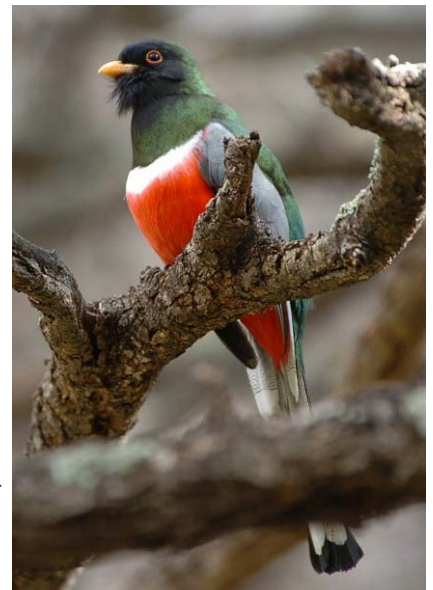
Elegant Trogon