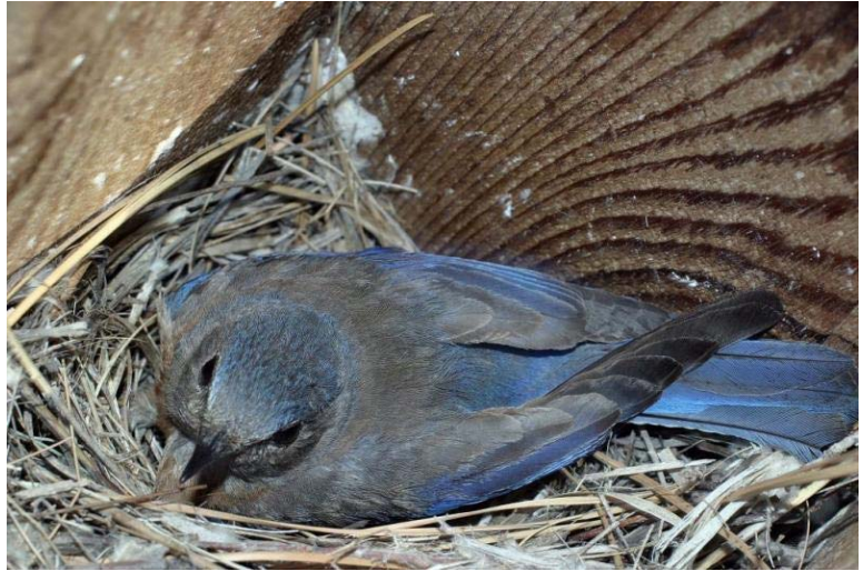
This sweet Mrs. Mountain Bluebird needs some help getting her favorite nest box ready for this years young-uns.