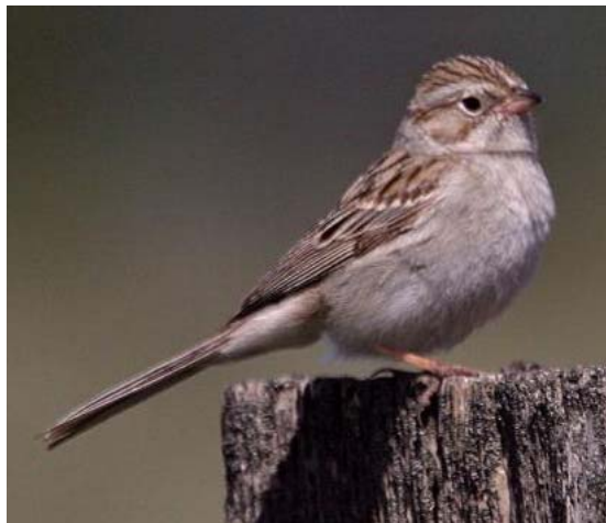
Brewer's Sparrow in the shrub-steppe area of the Green Ranch

on the Green Ranch. To be sure, one can easily see 60 species by driving to various habitats. But, I can't think of another place where a morning's birdwalk can result in such an impressive tally. This is a primary reason why the Washington Department of Fish and Wildlife and the Yakima Valley Audubon Society are focusing on preserving the Green Ranch as natural habitat, a wish of Gary Green, too.