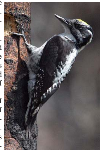
American Three-toed Woodpecker

Days earlier at the burn, biologist Jeff Kozma incurred the ire of one of six pairs of Hairy Woodpeckers. Their distress calls attracted a pair of Black-backed Woodpeckers. The three nesting White-headed Woodpeckers in the area chose to remain aloof of the skirmish...evidently marching to the beat of a different drummer.