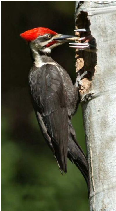
Pileated Woodpecker feeding the kids!

The June 11 YVAS field trip targeting woodpeckers along the Middle Fork of Ahtanum hit the bull's eye. At the Sedge Ridge burn just above the Ahtanum Campground, recently fledged Black-backed Woodpeckers tagged nonchalantly after