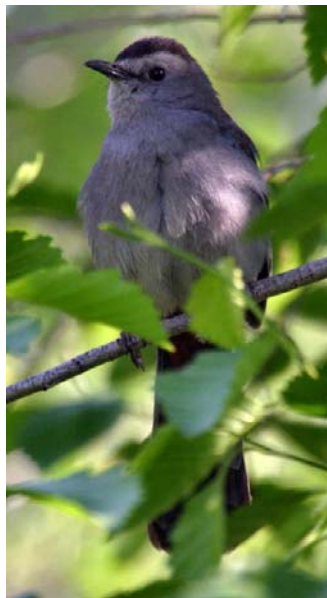
Gray Catbird

Bobolinks, one of the county's last breeding birds to return each year, were linked to