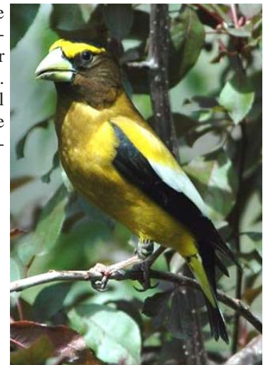
Evening Grosbeak

For the next several weeks, we can kick back and enjoy the birds that have chosen our valley to rear their young. Breathe deeply! All hail our airs heirs.