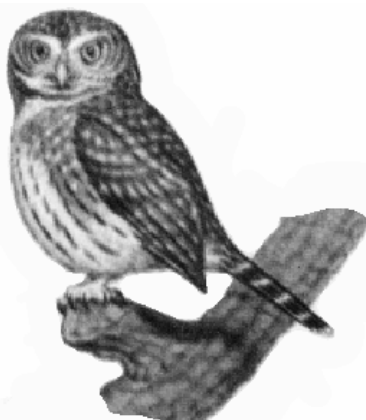
Northern Pygmy Owl