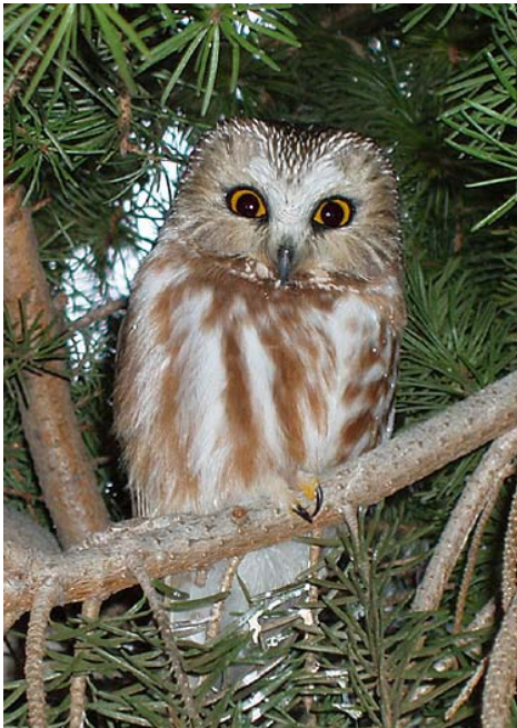
Northern Saw-Whet Owl

The Yakima Valley count, held on December 18, had 26 participants plus four feeder watchers. This effort tallied 88 species; this ties the record set in 1998. A total of 18,501 birds were counted, about average for the past 20 years.