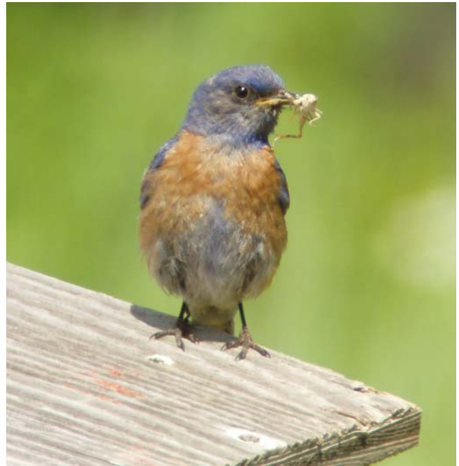
Male Western Bluebird on its box on the Vredenburg Bluebird Trail along the North Wenas Road.

There is good news, however. Bluebirds are cavity-nesters that will adapt readily to nest boxes in the absence of natural cavities. Nestbox programs to replace the loss of cavities in