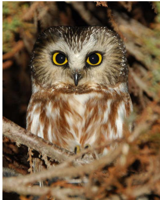
Northern Saw-whet Owl

prolonging its stay is a Red-breasted Sapsucker first noted at Randle Park during the Dec 16 CBC. In early February, fresh holes drilled by this sap were flowing freely...maybe spring is at hand.